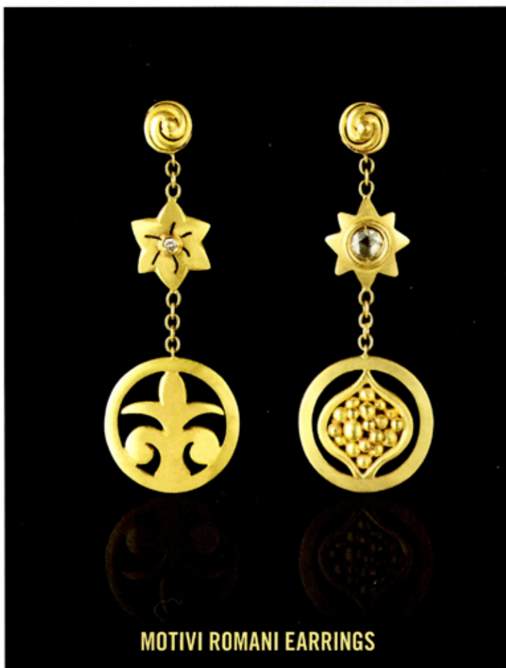
MOTIVI ROMANI EARRINGS