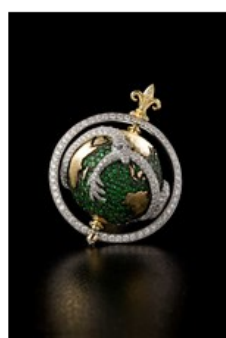
Liv Ballard Collection Capvt Mvndi Tsavorite Dragon Globe yellow gold and tsavorite pendant, encircled by a diamond dragon.