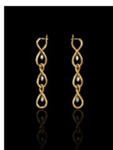
Liv Ballard Collection Analemma earrings in hammered yellow gold with briolette diamonds.