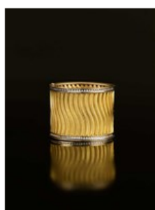
Liv Ballard Collection Cisterna Cuff in pleated yellow gold with pavé diamonds.