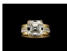
Liv Ballard Collection Sacro Vincolo Unchained gold ring, set with a 5.80ct Asscher-cut diamond.