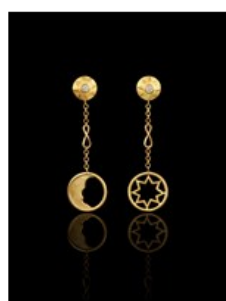
Liv Ballard Collection Cosmos earrings in yellow gold and diamonds.