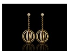
Liv Ballard Collection Orrechini Cerchi Piroetta Spinning Hoop earrings in yellow gold with diamonds.