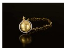
Liv Ballard Collection Capvt Mvndi Gold Globe yellow gold pendant with diamond pavé, suspended in a white gold and diamond armillary.