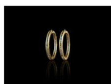
Liv Ballard Collection Orrechini Cerchi Zaffiri hoop earrings in yellow gold, set with deep blue sapphires.