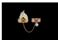
Liv Ballard Sacro Vincolo Alato yellow gold and diamond linked rings with ruby accents.